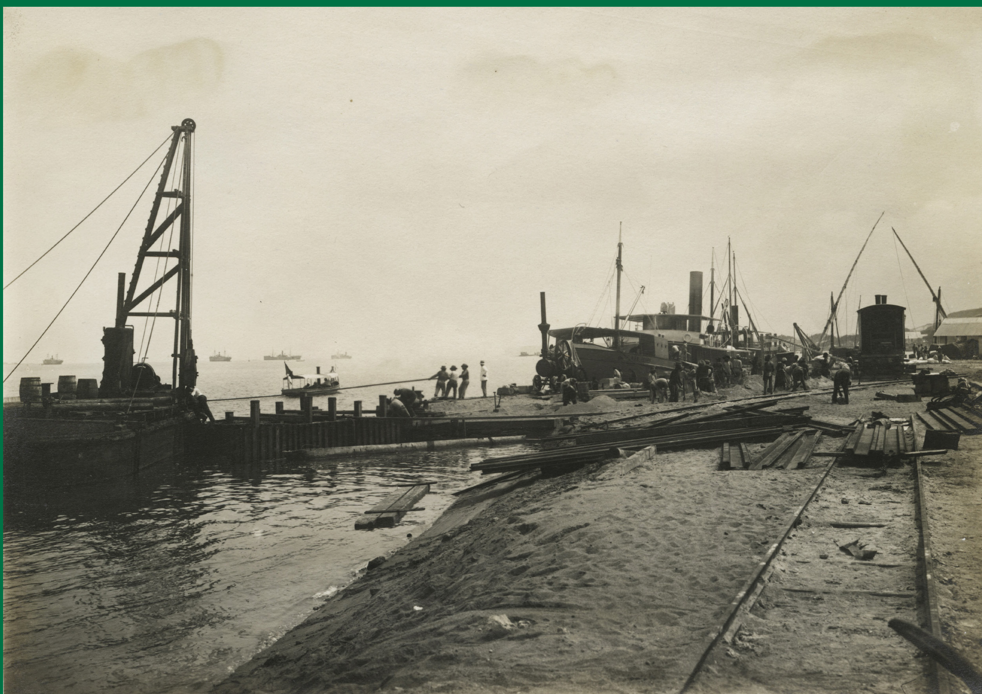
Angola, Port of Lobito, 1973 PT, AHU, AGU/PG 2469

These records regard mainly: railway lines, stations and buildings, ports, lighthouses, bridges, viaducts, tunnels, roads and hydraulic works such as dams, floodgates, water supply and other basic sanitation facilities; urbanization matters; civil and military public buildings such as housing, post offices, customs, hospitals, schools, prisons, military barracks and fortresses.